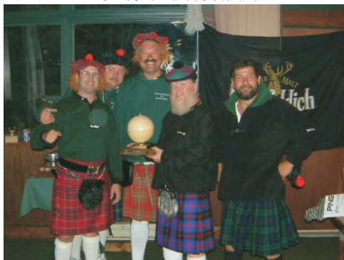
Presentation of Team Championship Trophy