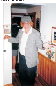
So You re Single