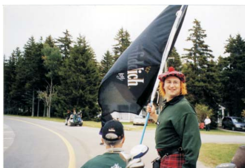
The Hound Parade Marshall