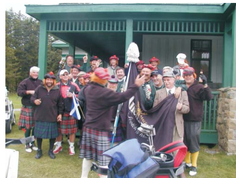
Electric Dog Leads a Song